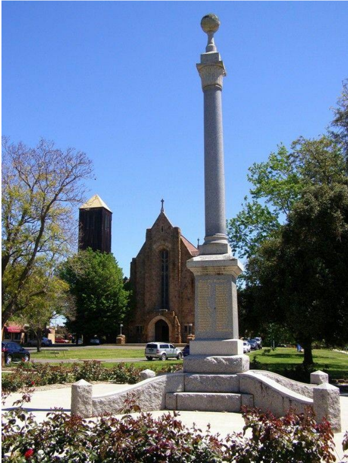
Wangaratta War Memorial